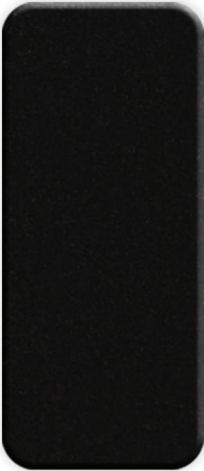
EMERALD BLACK ER 1003 4SDTI | 3SDRB