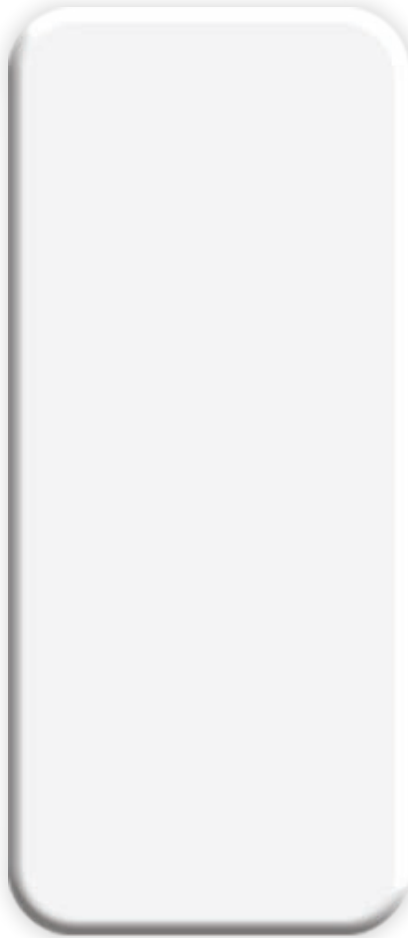
IVY WHITE ER 1005 4SDTI | 3SDRB