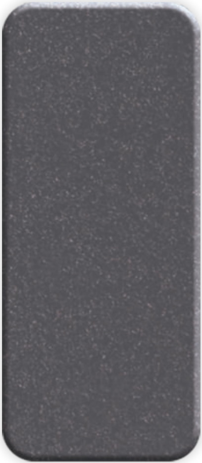
OASIS DARK GREY ER 1001 4SDTI | 3SDRB