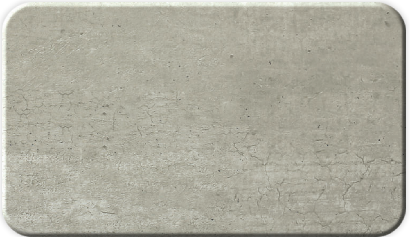
TENDER BARK ER 1053 4MTDM | 3MTDM