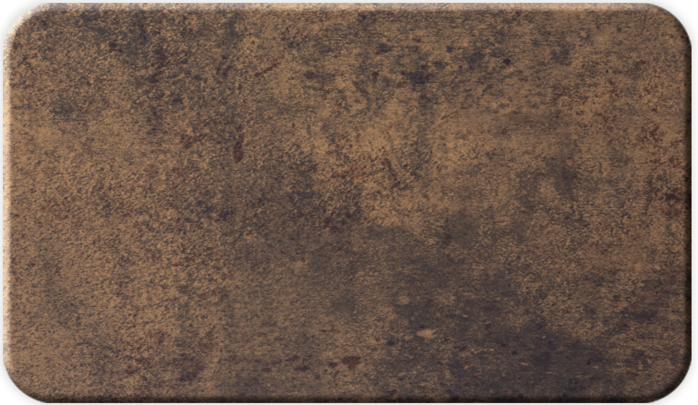
DUSK FOREST ER 1052 4MTDM | 3MTDM