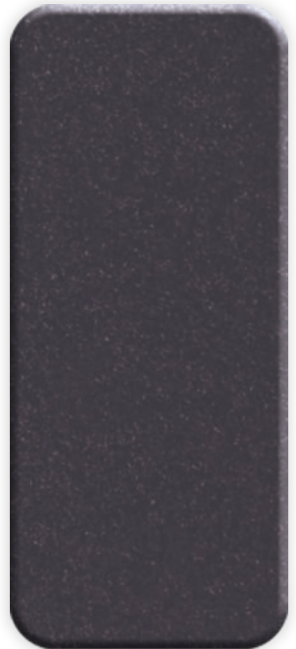
THAR GREY ER 1002 4SDTI | 3SDRB