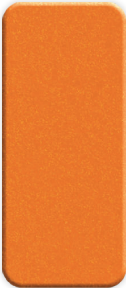
MONARCH ORANGE ER 1006 4SDTI | 3SDRB