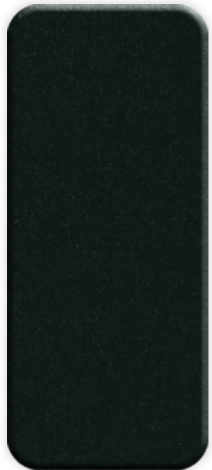
CARBON BLACK ER 1004 4SDTI | 3SDRB